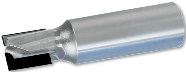
Two Flute Diamond Router Bit